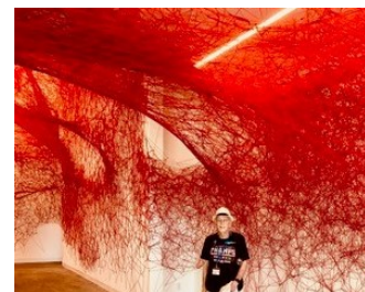
"Never being at the Hammer Museum I