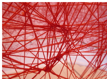
Shiota used red, black, or white yarn as a base