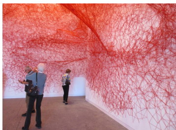
OLLI members walking through Chiharu Shiota,

Here's a few pictures members took from this amazing bus trip! Please see our Fall 2023 catalog for upcoming tips that you won't want to miss!